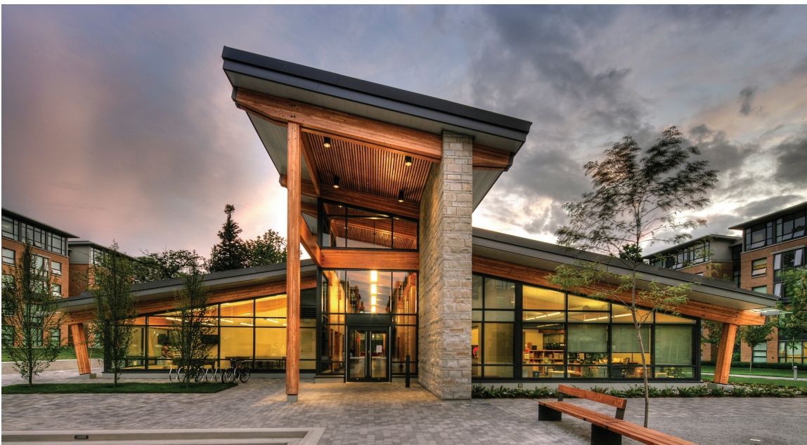
Marine Drive ( https://www.flickr.com/photos/ubcpubaffairs/9599450729)

Information table details and venue map on reverse