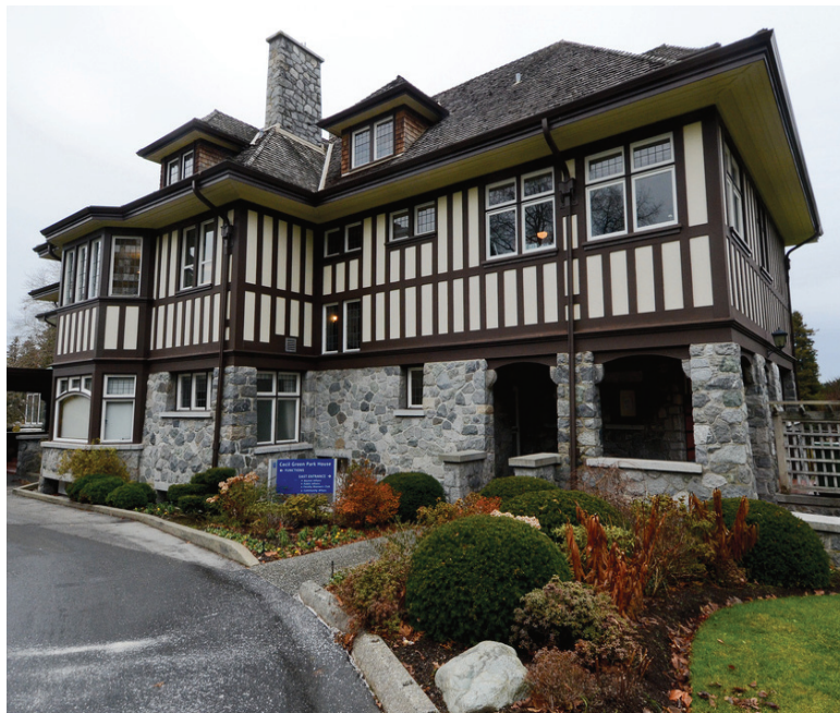
Cecil Green Park House (UBC)

The Faculty Pension Plan (FPP) Pension Forum will take place on Wednesday, May 21, 2014 . This is a great opportunity for members to learn more about their pension plan, and to meet the FPP trustees, management and staff. There will also be a presentation from the FPP management and trustees, followed by a question and answer period. Light refreshments will be served.